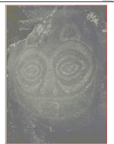
Tsagaglatal; "She who Watches" a petroglyph at Horsethief Lake State Park.

Over time, the population of the Mid-Columbia region shifted from a hunter-gather subsistence pattern to more settled villages beginning around 2,000 B.P.E. One of the oldest known settlement sites in the area, south of Klickitat County in Oregon, dates to 9,785 years ago. 1